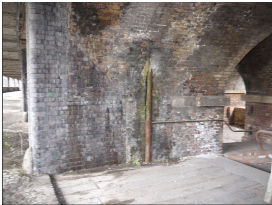
EXAMPLES OF BRICKWORK REQUIRING REMEDIAL MEASURES - Please refer to Structural Engineers report for description of required works.